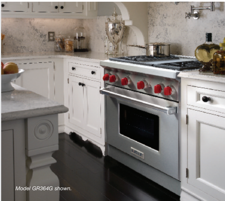
Model GR364G shown.

Wolf has perfected the form, function and sheer durability of our gas ranges. Wolf gas ranges offer standard features such as an infrared oven broiler, convection baking, dual-stacked sealed surface burners and our signature large red control knobs. Optional infrared charbroiler and infrared griddle give you the freedom to customize your gas range. Wolf gas ranges are available in natural or LP gas.