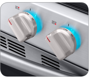
Blue LED Illuminated Knobs