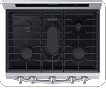
Powerful, Flexible Cooktop